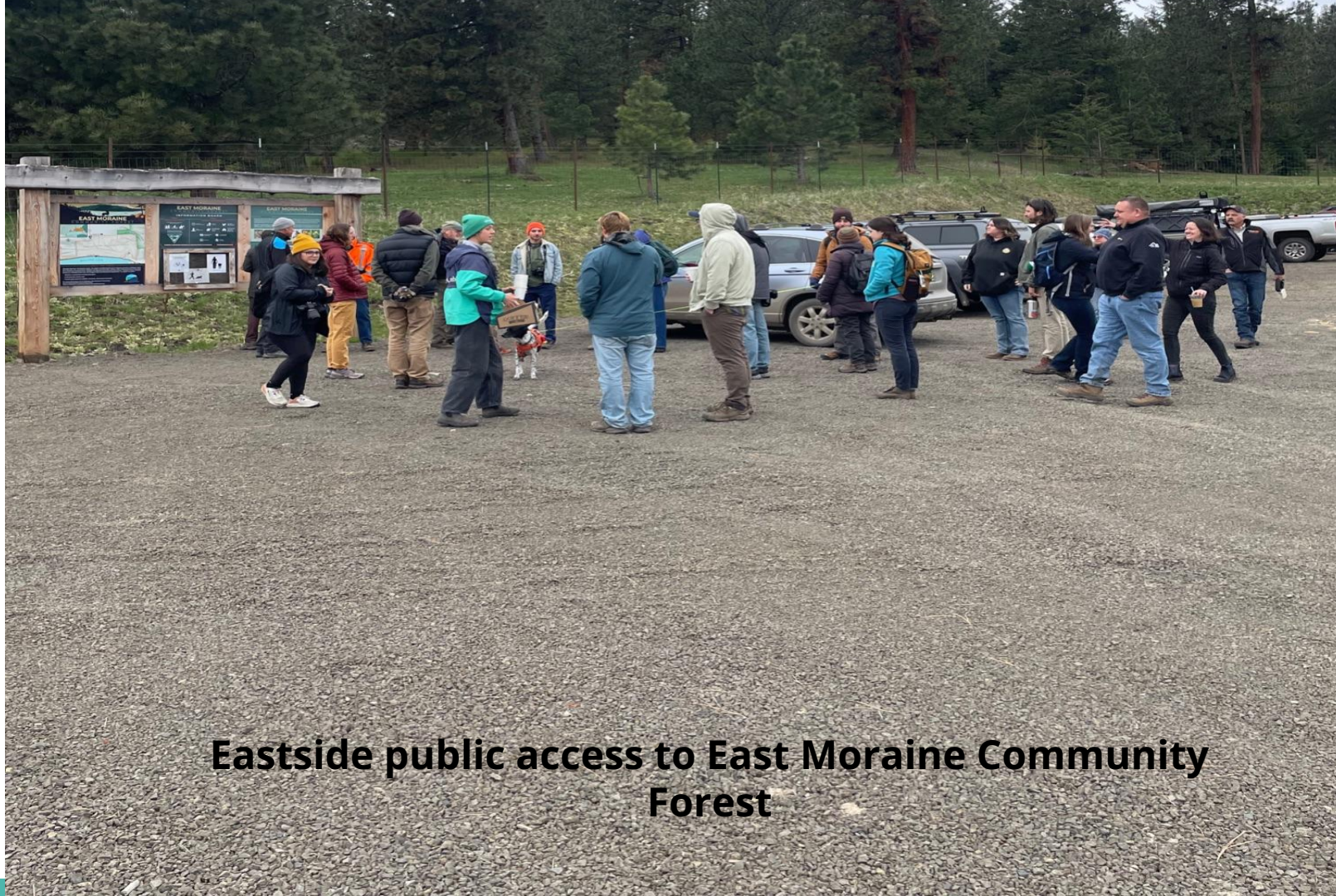
Eastside public access to East Moraine Community Forest